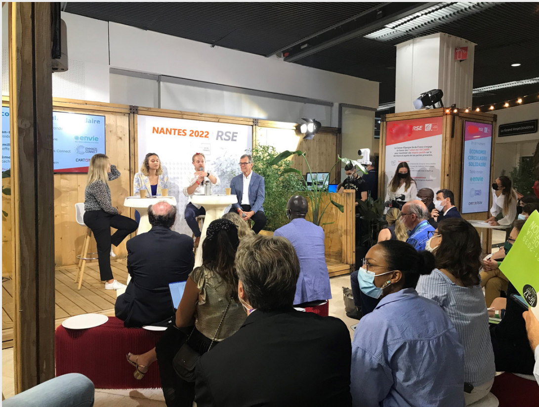
Meetings on the agora